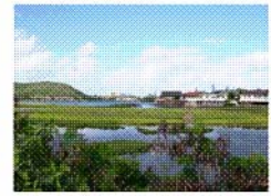
Ka'elepulu Reconstructed Wetlands