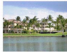
Fairway Villas - Waikoloa

General Email: Info@BillsEngineering.com